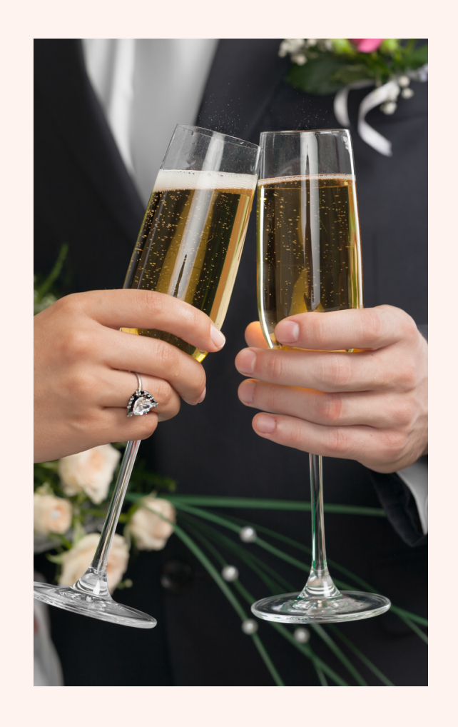
INCLUDES EVERYTHING IN PACKAGE 1 AND 2 PLUS: